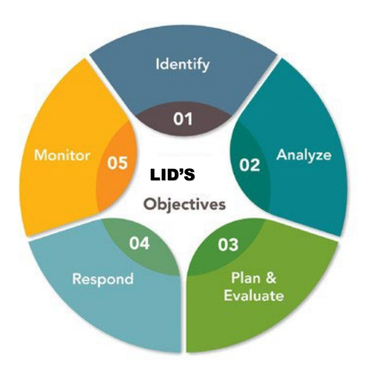
Figure 3. ERM 5-step process